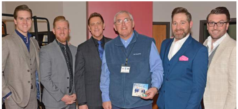
Thank you to all who joined us at Lima Community Church on February 2nd for the Ernie Haase and Signature Sound and Legacy Five Concert! We had a great time honoring the Lord.