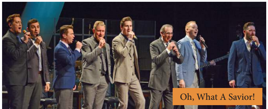
Oh, What A Savior!