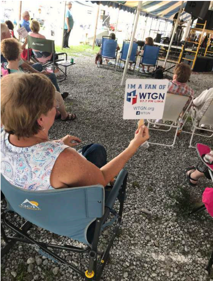
There were a lot of “WTGN Fans” at Music In The Park this year. We’re thankful to be a part of the day.