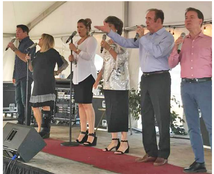
The Hoppers sounded amazing at the Auglaize County Fair Gospel Tent this year!