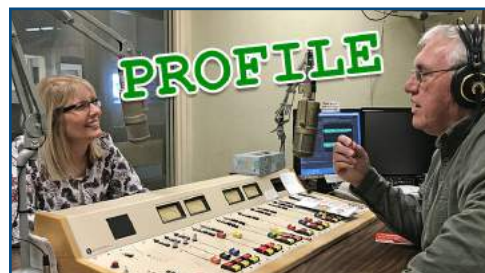
Saturday & Sunday @ 5:00 PM