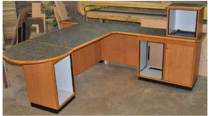
Here's a look at our stand-up studio desk for the Control Room. Each studio will feature custom hardwood desks with steel counter supports.

There's still opportunity to partner with us to ensure the studio upgrade is a success. To contribute, please call us at 419-227-2525, mail your donation to: WTGN Radio, 1600 Elida Road, Lima, Ohio 45805, or visit us at WTGN.org and click "Donate." Thank you for partnering with us to Witness The Good News.