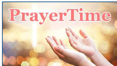
Weekdays @ 9:05 AM