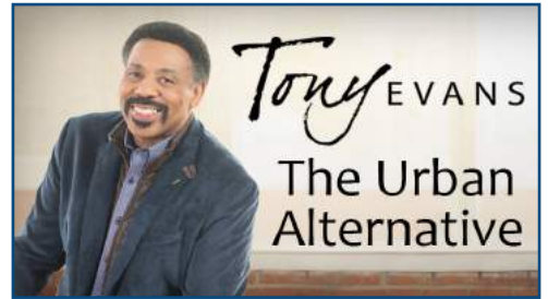
Weekdays @ 1:30 PM