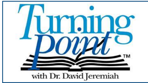
Weekdays @ 12:30 PM & 9:30 PM