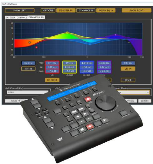
The VoxPro digital audio editing system will enable us to record, edit and air phone calls and audio clips in moments.