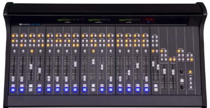
The AudioArts Lightning analog radio mixer will equip us for broadcast in our newly redesigned control and production studios. These boards will replace the Pacific Recorder boards that we've used since 1996.