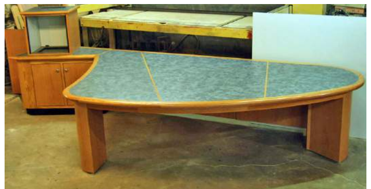
The PrayerTime studio will feature a new desk configuration for enhanced production capabilities. This studio will also include video technology that will allow us to broadcast live and recorded programming.