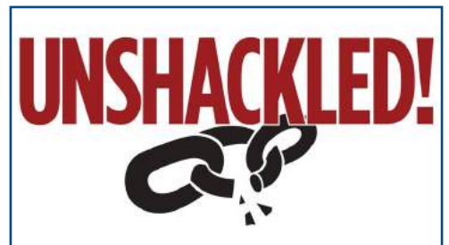
Each Day @ 8:30 PM & Sat / Sun @ 2:00 AM