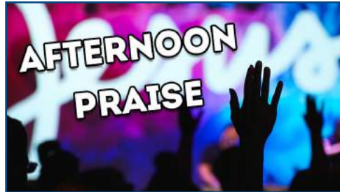
Weekdays from 2 PM to 4:30 PM