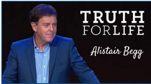
Weekdays @ 8:30 AM