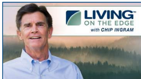
Weekdays @ 9:30 AM