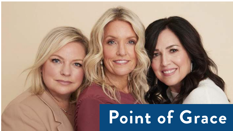
Point of Grace

For more information, visit: www.musicinthepark.info