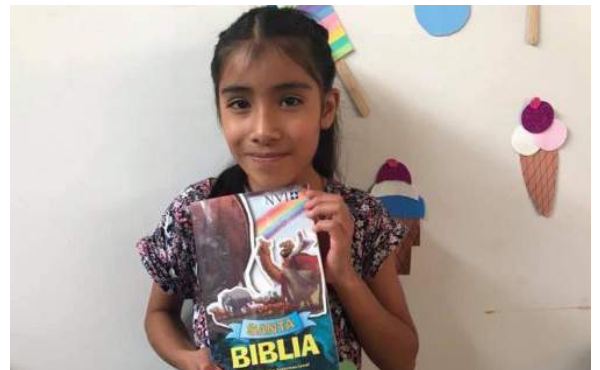
Children all around the world receive Bibles through the ministry of Mission Cry.